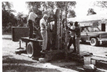
Well drilling rig

God has blessed the effort in the last couple years by helping the crew to keep a spiritual focus and remembering that they are serving Him by helping their own people. In 2002, twenty wells were drilled and an additional twenty three existing pumps were serviced or replaced. Considering the resources we have to work with, there is a lot to be thankful for. We can testify that when we are trusting the Lord and serving out of the proper motives, the work has been blessed.