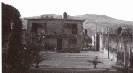
Guesthouse in Ixtlan

A new guesthouse was completed in 2001 to accommodate individuals working in this ministry as well as others who are visiting the work. It provides a place for young group activities and to teach English and computer skills. There is currently a need for older mature couples to manage the guesthouse for 2-4 week time periods during the summer.